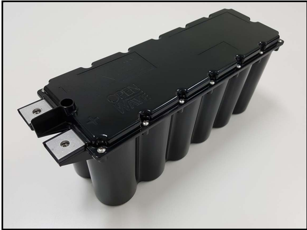
<Fig. 1> Product Image